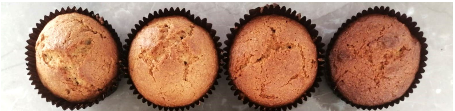
Figure 1. Images of Cupcake Samples control, 10% MSP, 20% MSP, and 30% MSP (from left to right, respectively)

MSP: Melon Seed Powder, Different letters within a column indicate significant differences at p < 0.05