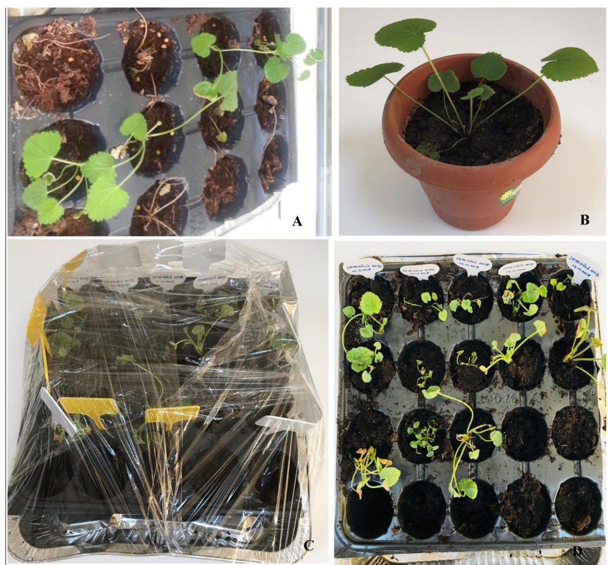
Figure 4. Soil transfer and accilimization. Directly regenerated plantlets from shoot tip (A and B), regenerated plantlets from node explants (C and D).