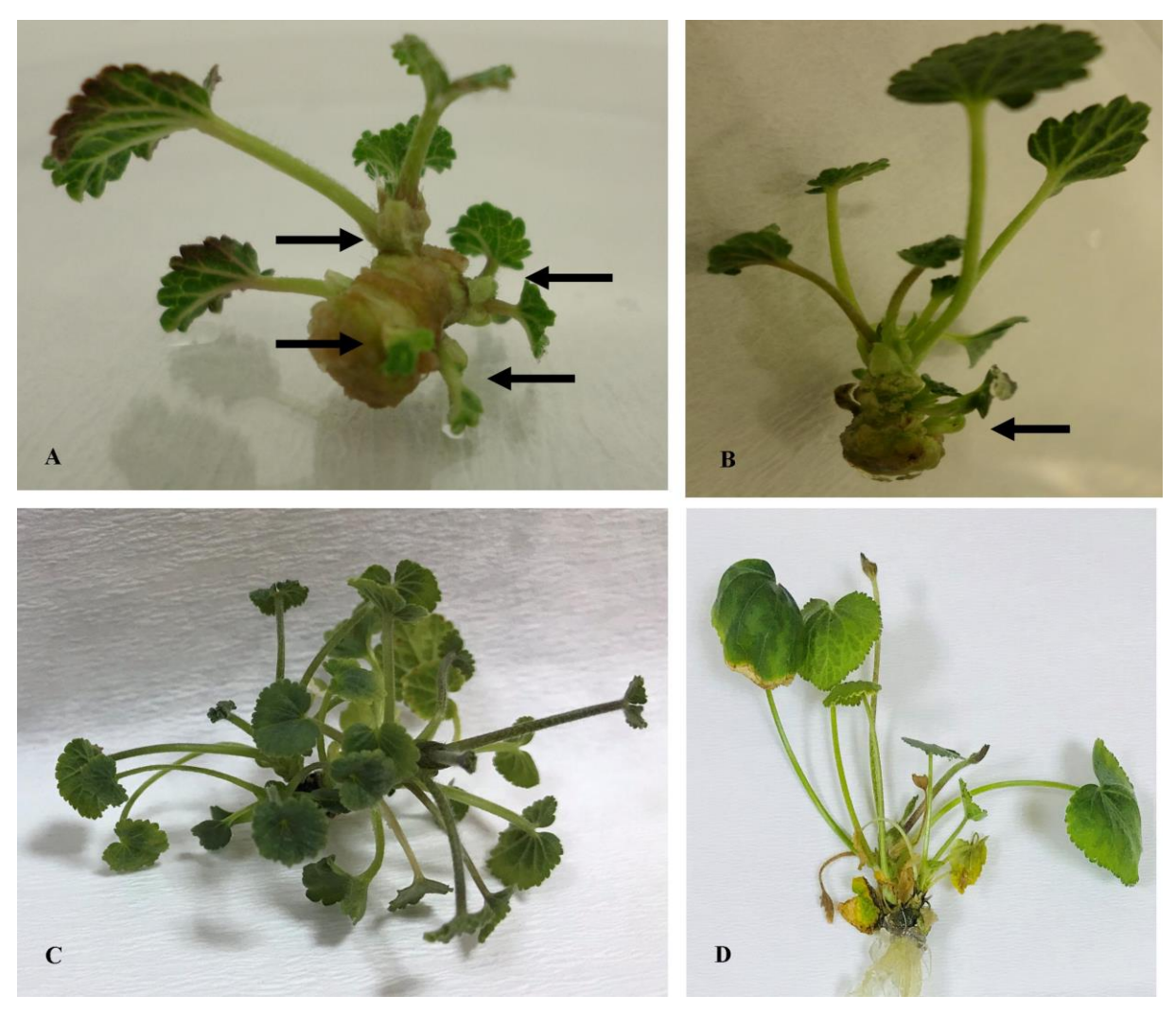
Figure 2 . Micropropagation of devegülü hollyhock from node (A and C) and shoot tip (B and D). Arrows show new shoots.