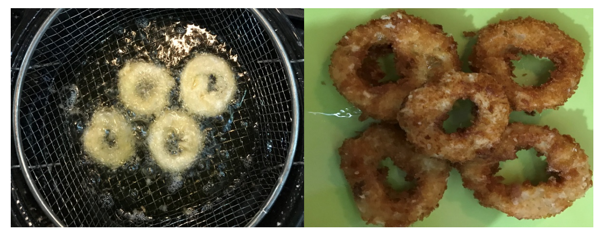
Figure 2. Fish onion rings.