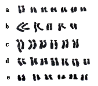
Fig. 2. Karyograms of the studied taxa. a) V. peregrina . b) V. anatolica . c) V. hybrida . d) V. narbonensis var. narbonensis . e) C. scorpioides