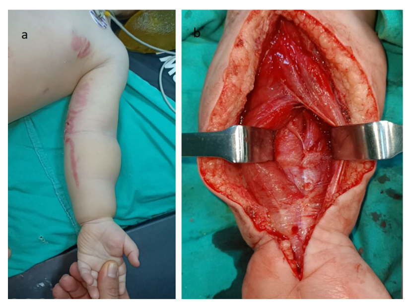
Figure 1. A 14-month-old girl with left forearm compartment syndrome and total neurological dysfunction of the hand. a) Ecchymosis of the skin due to inappropriate and tight stabilization by traditional methods. b) Forearm fasciotomy showing pallor of muscles with initiation of necrosis in the deep volar forearm compartment.

Table 2. Features of diagnosed injuries among the patients