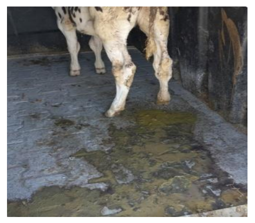
Figure 1. Diarrhea in a calf infected with Salmonella spp.

Each of the 12 calves examined in the study exhibited clinical manifestations, including intermittent high fever, pneumonia, diarrhea, anorexia, and dehydration. Arthritis, fibrinous and hemorrhagic feces were detected in only two calves. The fecal samples from the 12 calves in the study demonstrated a watery and voluminous consistency (Figure 1). The feces of 8 of the 12 calves with diarrhea were analyzed for rotavirus, coronavirus, Cryptosporidium parvum, Giardia and Escherichia coli with the rapid antigen test kit (BoviD-5 Ag, Bionote, Inc. Korea) and no causative agent was detected. Blood samples taken from 12 calves showing clinical signs were polymerase chain reaction (PCR) tested for Bovine viral diarrhea virus in a private laboratory and negative results were obtained.