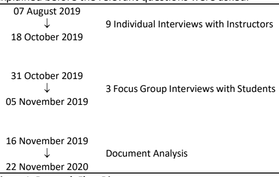
Figure 1. Research Flow Diagram

interview room. Individual interviews took approximately 30 min. The students were briefly informed about the research during a break. The contact information of the students interested in participating in the study was obtained, and a group was established on the social media platform to continue communication. Then, at the face-toface meeting with the students on the specified day and time, they were informed in detail about the research, their questions were answered, and they were invited to participate in the study. The interviews were conducted face-to-face in lecture halls or laboratories at the Faculty of Nursing. A graduate student (B.C.) attended the interviews to take notes and create an objective atmosphere—this student had no relationship with the students involved in the focus group interviews. Focus group interviews were approximately 1.30 hours in length. All interviews were audio recorded. 360-degree assessment was briefly explained before the relevant questions were asked.