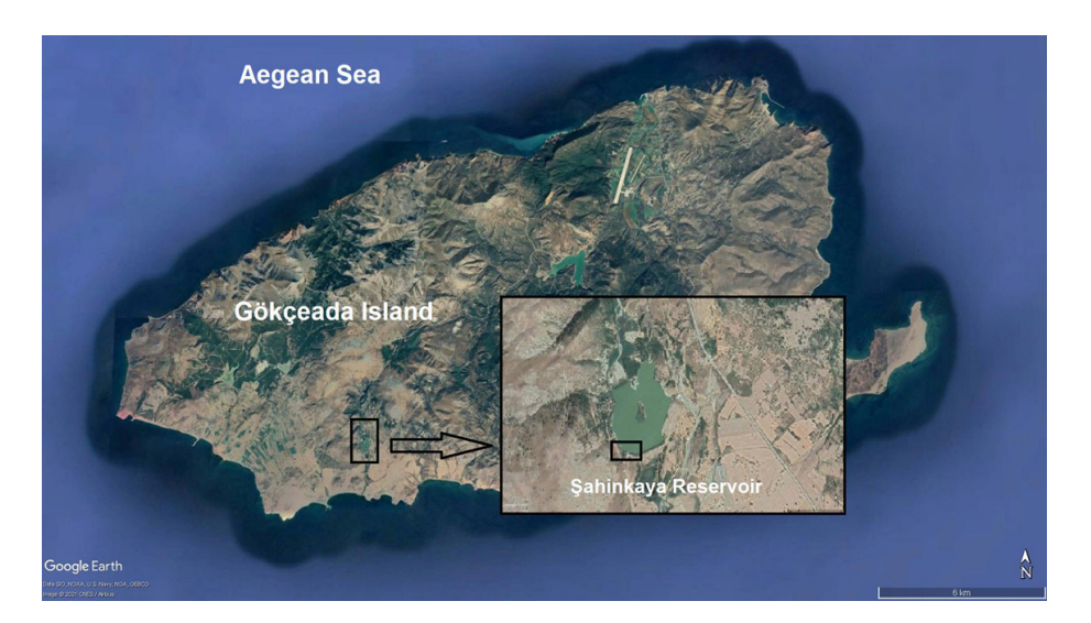
Figure 1. Map of sampling location in Şahinkaya Reservoir (Gökçeada Island, Çanakkale, Turkey)

Specimens of P. borysthenicus were collected seasonally from May 2020 to January 2021 from Şahinkaya Reservoir (40.1134000 N, 25.7721278 E; Gökçeada, Turkey) using electrofishing (SAMUS 1000 portable electroshocker; frequency 50-55 Hz). It is a shallow reservoir that was established for irrigation purposes on the Çıkırım Stream. Fish were sampled from approximately 100 m of shoreline with a max. depth of 1 meter in the reservoir's south region (Figure 1). Fish specimens were anaesthetized with clove oil and transferred to laboratory on ice. Total length (TL), fork length (FL) and standard length (SL) were all measured with a precision of 0.1 cm in the laboratory. On digital scales with a sensitivity of 0.01 g, total body weight (W) was weighed. Fish were sexed using a microscopic or macroscopic examination of the gonads. Observed sex ratios (female to male) were compared to the theoretical 1:1 ratio using the test of chi-square (Zar, 1999).