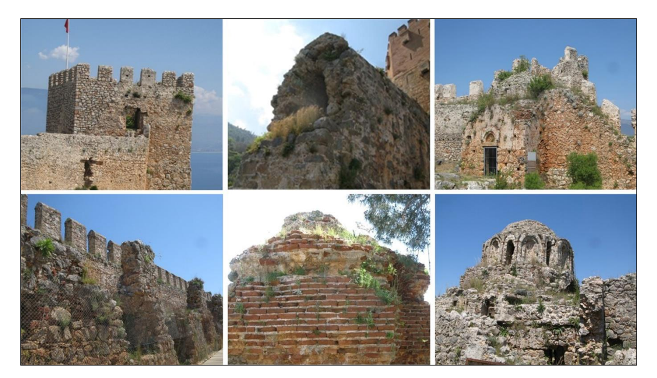
Figure 2. General views of Alanya Castle