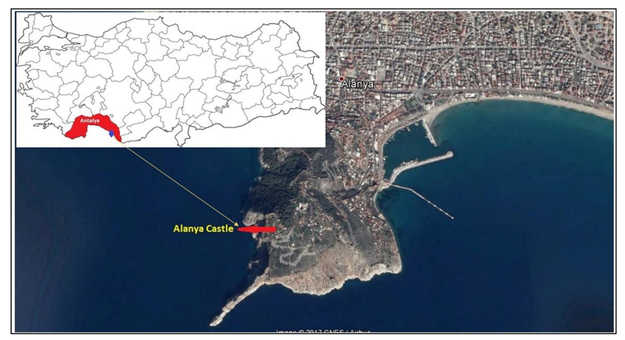
Figure 1. Location of the study area

Collected specimens were thoroughly evaluated using the relevant literature for species identification. "Flora of Turkey and the East Aegean Islands" and its appendices were used for identification of the taxa assessed in the floristic analysis [32-34]. The life forms of plants were determined according to Raunkiaer's system [35]. The threat categories of endemic plants were determined using the Red Book of Turkish Plants and IUCN 2017 [36,37]. Turkish plant names were written using The Plant List of Turkey (Vascular Plants) given by Güner et al. (2012) and also the relative abundance of each plant species was determined by using Braun-Blanquet [38,39]. Further, the position of the plants on the walls was noted during the field study.