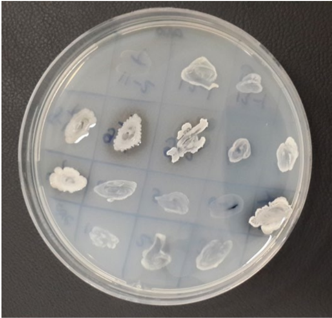
Figure 1. Figure 1. DNase test results in S. aureus isolates.