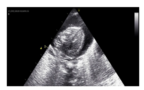
Figure 1. Massive pericardial effusion.