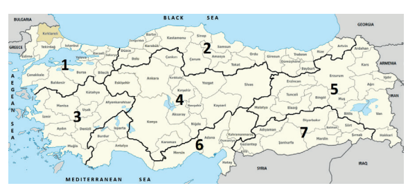
Figure 5. Provincial and regional distribution patterns of Xylosteus spinolae Frivaldszky von Frivald in Türkiye [1) Marmara region, 2) Black Sea region, 3) Aegean region, 4) Central Anatolia region, 5) Eastern Anatolia region, 6) Mediterranean region, 7) South-Eastern Anatolia region]

On the other side, the C- and SE European species has been recorded only from one province of 81 provinces in Türkiye up to now. According to this, it was firstly recorded by Sama and Rapuzzi (1999) from Kırklareli province (Yıldız Mts., from Demirköy to İğneada) as X. spinolae caucasicola in pupal cell on Corylus avellana . Then, it was reported by Sama (2002) from Kırklareli province (Demirköy) as X. spinolae caucasicola . In addition, the specimen given in the present study is also from Kırklareli province (Demirköy). As a result, the species is known only from one province in Türkiye now as Kırklareli province in European Türkiye part of Marmara region of Türkiye (Figure 5).