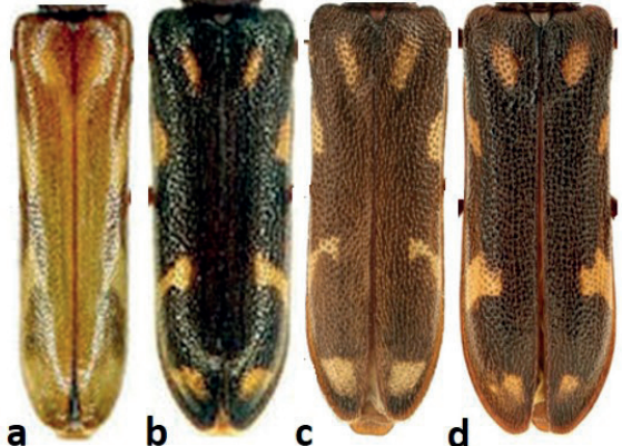
Figure 6. Elytral designs of a. Leptorhabdium caucasicum (Kraatz), b. Xylosteus caucasicola Plavilstshikov, c. Xylosteus kadleci Miroshnikov, d. Xylosteus spinolae Frivaldszky von Frivald

The primitive and hardly studied tribe Xylosteini Reitter is represented with four species of two genera in Türkiye as Leptorhabdium caucasicum (Kraatz, 1879), Xylosteus caucasicola Plavilstshikov, 1936, X. kadleci Miroshnikov, 2000 and X. spinolae Frivaldszky von Frivald, 1837. A little information about the host plants of only eight species among the 25 species of eight genera within the Xylosteini tribe worldwide has been determined by various authors up to now. Therefore, detection of the unknown data on biology and distribution of the most primitive and hardly studied group are of great importance. Accordingly, at least five or six host plants for each species of four Turkish taxa in the tribe Xylosteini were determined with the present study. As a result, the members of the genus Leptorhabdium Kraatz are only preferred deciduous trees, while the members of the genus Xylosteus Frivaldszky von Frivald are preferred both deciduous and also coniferous trees. Abies nordmanniana (Pinaceae) and Fagus orientalis (Fagaceae) are determined as new host plant species for X . kadleci Miroshnikov. Besides, the genus Leptorhabdium apparently seems to be represented only by L. caucasicum in North-Eastern Anatolia of Türkiye, while the genus Xylosteus apparently seems to be represented by X. spinolae in European Türkiye, by X. kadleci in North-Western Anatolia of Türkiye, and by X. caucasicola in North-Eastern Anatolia of Türkiye.