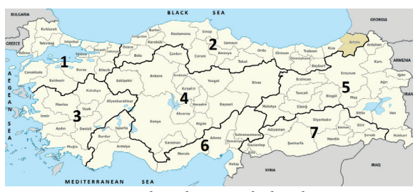
Figure 3. Provincial and regional distribution patterns of Xylosteus caucasicola Plavilstshikov in Türkiye [1) Marmara region, 2) Black Sea region, 3) Aegean region, 4) Central Anatolia region, 5) Eastern Anatolia region, 6) Mediterranean region, 7) South-Eastern Anatolia region]

On the other side, the Anatolia-Caucasian species has been recorded only from one province of 81 provinces in Türkiye up to now. A single record from Türkiye was given by Danilevsky (2012) from Artvin province in Eastern Black Sea region of Türkiye. The material given in the present study is the second record for Türkiye from Artvin province again (Figure 3).