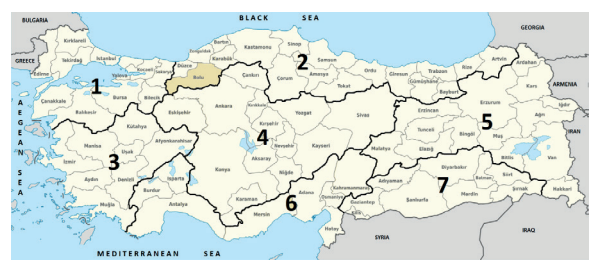
Figure 4. Provincial and regional distribution patterns of Xylosteus kadleci Miroshnikov in Türkiye [1) Marmara region, 2) Black Sea region, 3) Aegean region, 4) Central Anatolia region, 5) Eastern Anatolia region, 6) Mediterranean region, 7) South-Eastern Anatolia region]

province (Abant district) as X. spinolae caucasicola again. Lastly, it was recorded by Özdikmen (2011) from Bolu province (Abant district env.) as X. kadleci . In addition, the specimens given in the present study are also from Bolu province (Abant district, Abant Lake). As a result, the species is known only from one province in Türkiye now as Bolu province in Western Black Sea region of Türkiye (Figure 4).