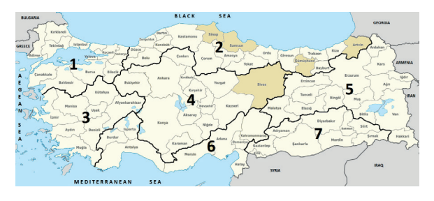
Figure 2. Provincial and regional distribution patterns of Leptorhabdium caucasicum (Kraatz) in Türkiye [1) Marmara region, 2) Black Sea region, 3) Aegean region, 4) Central Anatolia region, 5) Eastern Anatolia region, 6) Mediterranean region, 7) South-Eastern Anatolia region]

On the other side, the Anatolian-Caucasian species has been recorded only from five provinces of 81 provinces in Türkiye up to now. The known distribution of this species in Türkiye is as given by Özdikmen (2023). According to this, it was firstly recorded by Demelt (1963) from Sinop province (Boyabat district). Then, it was reported by Gfeller (1972) from Gümüşhane province (Torul district). Also, these records were repeatedly mentioned by Danilevsky (2014). In addition, it was recently recorded by Özdikmen (2023) also from Artvin, Samsun and Sivas provinces in Türkiye on the base of the material given in the present study. As a result, it is known from five provinces in Türkiye now as Artvin, Gümüşhane, Samsun and Sinop provinces in Black Sea region of Türkiye, and Sivas province in Central Anatolia region of Türkiye (Figure 2).