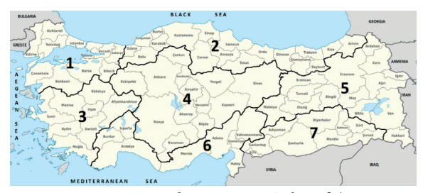
Figure 1. Provinces and regions in Türkiye [1) Marmara region, 2) Black Sea region, 3) Aegean region, 4) Central Anatolia region, 5) Eastern Anatolia region, 6) Mediterranean region, 7) South-Eastern Anatolia region]

The following text, synonyms, host plants and provincial and regional records in Türkiye for each different species were included under the scientific name based on personal data and available references. Available synonyms for each species, citing mainly from Danilevsky (2020, 2022), Özdikmen (2021b) and Tavakilian (2022). Mainly Švácha and Danilevsky (1989), Bense (1995), Tavakilian (2022), Hoskovec et al. (2023) and cited references in the related part and also data obtained from available specimens and Cerambycidae database of the first author were used to determine of the host plants of each species. Cerambycidae database of the first author to determine provincial and regional records in Türkiye for each different species were mainly used. The following map for provincial and regional distribution patterns in Türkiye of the species determined in the present study was used (Figure 1). New host plants are marked with the sign (*) on tables given in the text.