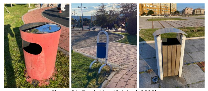
Figure 31. Trash bins (Original, 2022)

Metal-detailed, concrete-metal-detailed, and wood-metal-concrete detailed trash bins were used in the area (Figure 31).