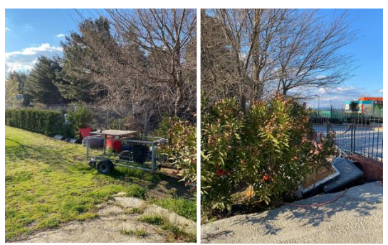
Figure 21. Stacked materials (Original, 2022)

Maintenance and Cleaning: When Özgürlük Park, which looks clean and well-maintained in its entirety, is examined in detail, it has been determined that there are some areas in need of care. The stacking of unused materials in the area located close to the park entrance caused a bad image (Figure 21).