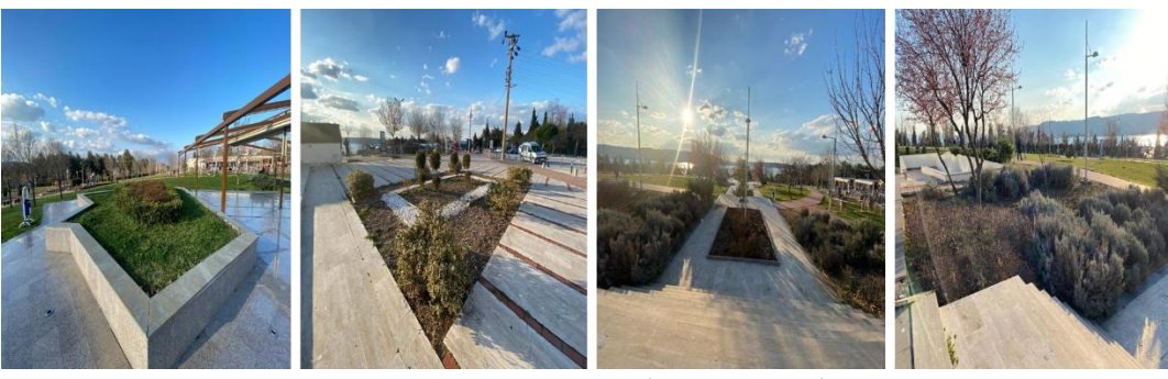
Figure 25. Plant partners (Original, 2022)

Charm/Attractiveness: Since the area is mostly green, plant beds were created to make the park more attractive and attractive (Figure 25).