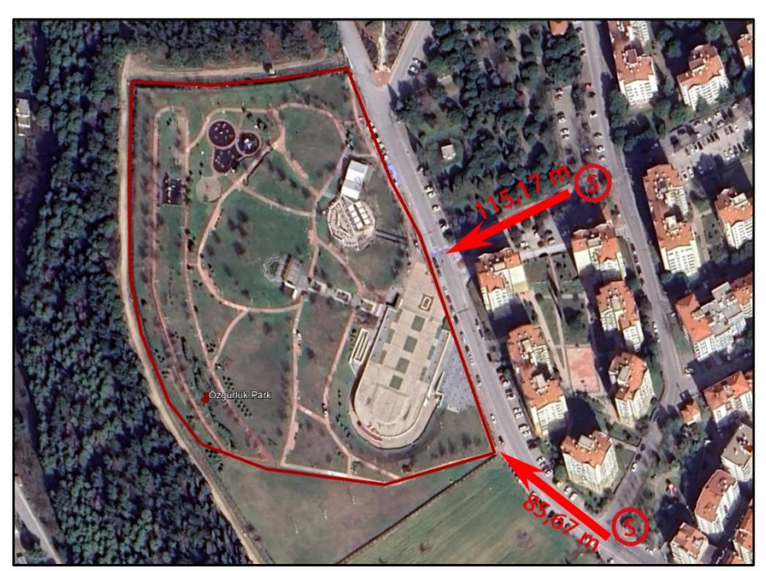
Figure 5. Nearest public transport stop locations (Google Earth, 2022)

There are 2 public transportation stops at 85,67 m and 115,17 m distance from the study area (Figure 5).