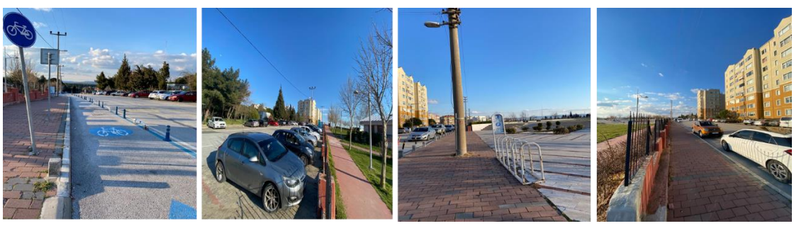
Figure 4. Bicycle path, parking lot, bicycle park, and vehicle pockets (Original, 2022)

Accessibility: According to Burn (1979), accessibility is defined as the freedom of individuals to participate in different activities in their social lives, and according to Hansen (1959), it is defined as the potential of all possibilities of interaction between individuals. Accessibility is an important factor in the evaluation of public green spaces in cities. The accessibility of individuals living in cities to activities in that region varies depending on the city unit they serve. The balanced distribution of the accessibility distance in the city is closely related to the quality of life of the citizens (Sağlık, Demir, Çelik, Durdymyradov & Bayrak, 2021). When the work area is evaluated in terms of accessibility, it is possible to reach the area by many means of transportation (bicycle, private vehicle, public transportation, electric scooter, etc.) or on foot. There is a bicycle path surrounding the park, a 6-car parking lot at the park entrance, and a bicycle park and vehicle parking pockets surrounding the park (Figure 4).