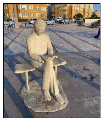
Figure 9. Symbolic sculpture (Original, 2022)

a space where they are alone (Külekçi, 2018). Therefore, in the study area, a symbolic statue was used at the entrance of the park to indicate that the park is also a resting area (Figure 9).