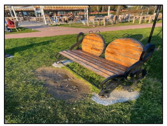
Figure 24. Sludge due to soil wear (Original, 2022)

Due to the erosion of the concrete flooding on the foundation of some of the seating elements used in the area, sludge has occurred in the soil. This resulted in the seating element not being preferred by the users and not being used effectively (Figure 24).