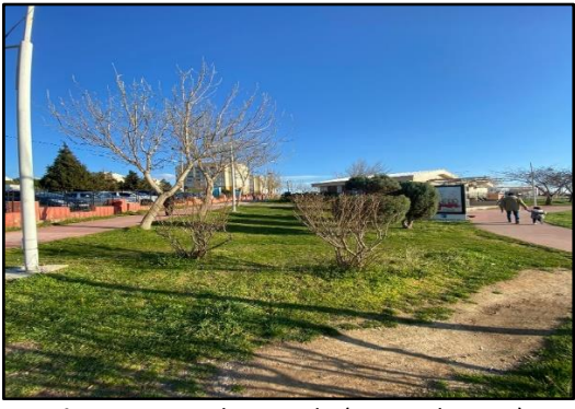
Figure 22. Trail example (Original, 2022)

The paths created by the users as shortcuts not only spoil the view but also cause muddying from time to time (Figure 22).