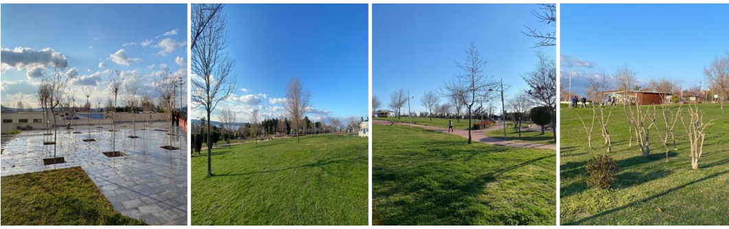
Figure 26. Calligraphic image with plant compositions (Original, 2022)

The colorful painting created on the walls made the work much more colorful and remarkable (Figure 27).