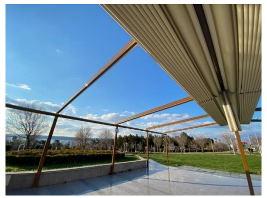
Figure 33. PVC tarpaulin shading element (Original, 2022)

There are not many shading elements in the area, since it is generally a light green area. PVC tarpaulin shading element, which can be opened and closed, is generally used in the seating areas (Figure 33).