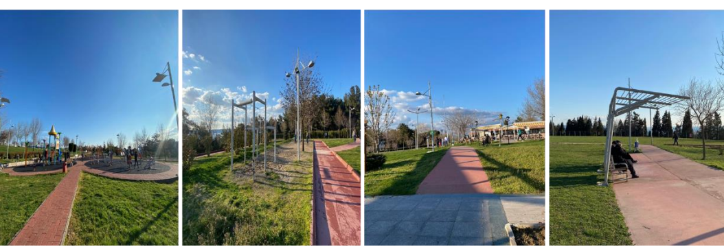
Figure 18. Interactive uses (Original, 2022)

Interactive: The park is an area where both individual and community activities can be carried out easily. Many entertainments, rest, walking, cycling, doing sports, etc. uses are not disconnected from each other, but are positioned in a way that they can interact (Figure 18).