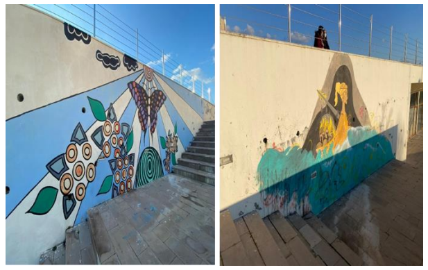
Figure 27. Murals (Original, 2022)

The colorful painting created on the walls made the work much more colorful and remarkable (Figure 27).