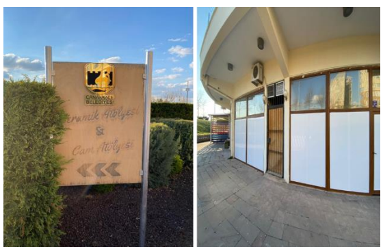
Figure 16. Glass-ceramics workshop (Original, 2022)

Inclusivity: The area provides opportunities for communities of all ages and walks of life to come together and carry out activities without discriminating between men, women, old and young. At the same time, the uses were designed and created by considering architectural standards such as slopes and dimensions suitable for disabled use (Figure 17).