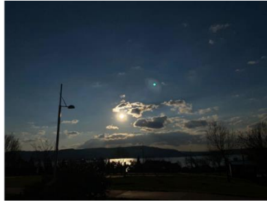
Figure 12. Dominating landscape (Original, 2022)

Use of Space for Different Purposes: The main purpose of Özgürlük Park is to provide an area where the people of the city can have fun and rest, and perform their social activities in an area that is away from the stress of the city and integrated with nature. This area does not only serve people but also provides shelter and feeding opportunities for animals. In the park, there are areas where many animals can roam, animal kennels, food bowls, bird water pools, and waste bins and bags for animal excrement (Figure 13).