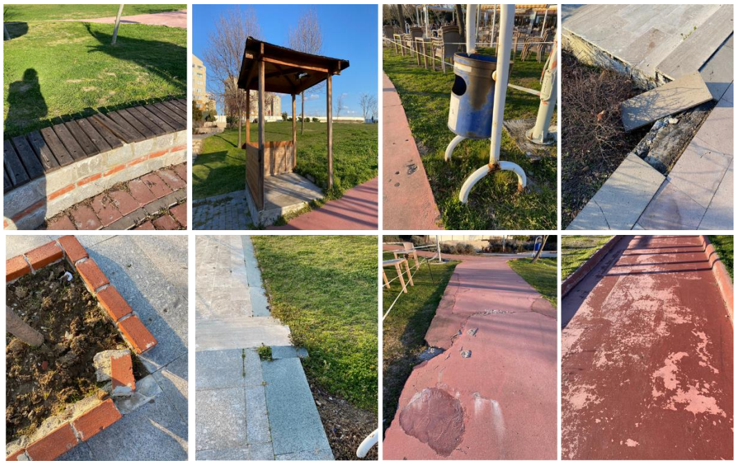
Figure 23. Maintenance-free reinforcement elements (Original, 2022)

Partly broken and neglected reinforcement elements, unrepaired borders, cracked and peeled floor coverings in the park caused the area to look neglected (Figure 23).