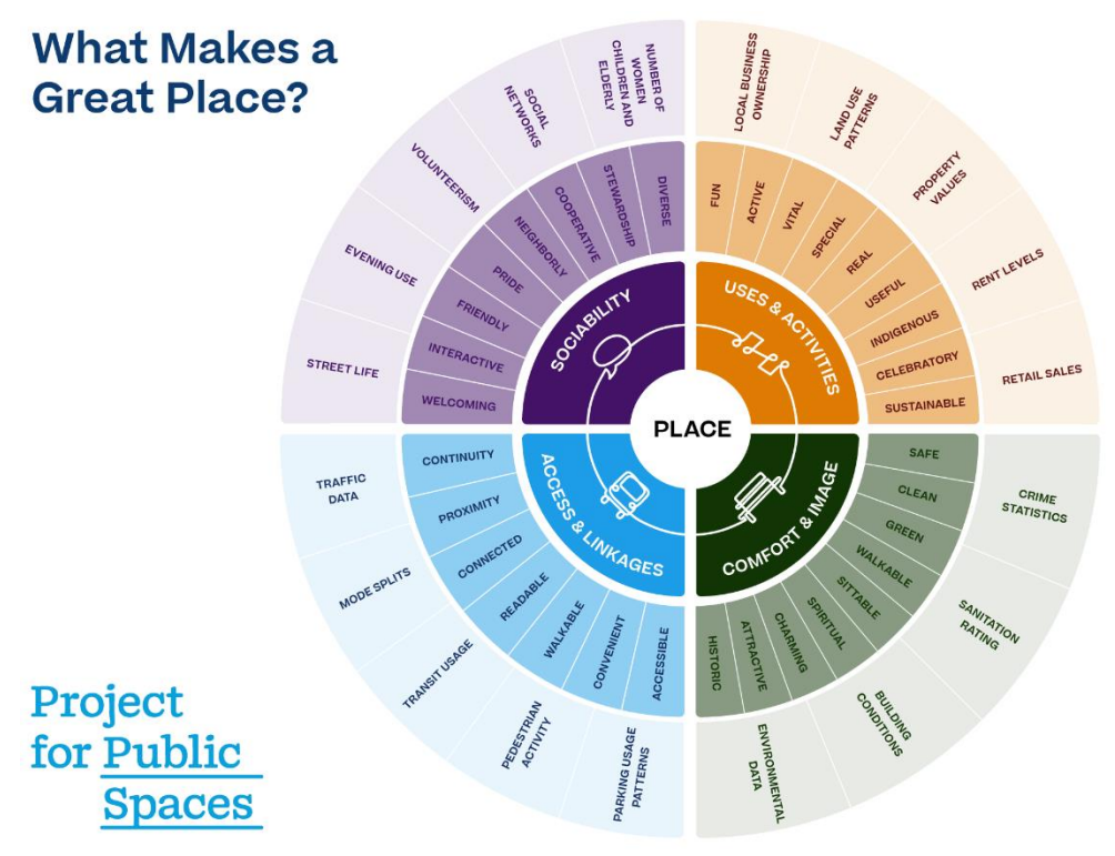
Figure 3. Space quality diagram defined by the project for public space (PPS) (Project of Public Spaces, 2022)

The landscape research method based on the survey, data collection, analysis, and synthesis was used in the process of the study (Sağlık et al., 2014). The study was carried out in 4 stages: