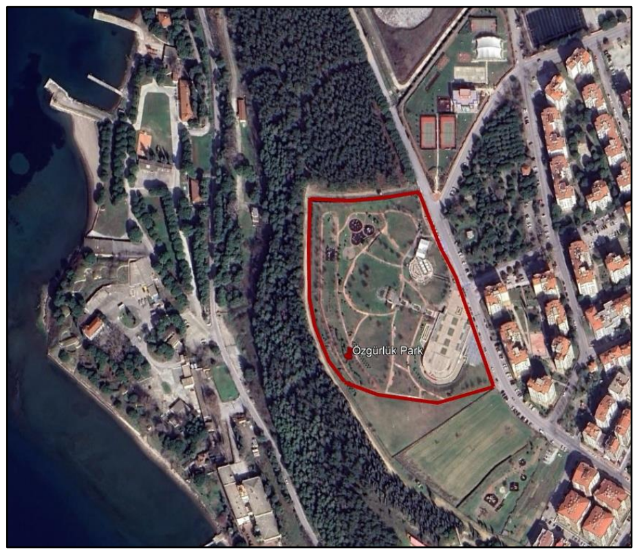
Figure 1. Workspace (Google Earth, 2022)

Özgürlük Park, which is connected to the Esenler District of Çanakkale city, has been determined as the study area (Figure 1). Özgürlük Park is located at latitude 40.163357 and longitude 26.407953. It has been chosen as the study area because it is a public open space that can appeal to different age groups and different class users, and also because it is very rich in terms of plant material, which is one of the most important parameters when determining the quality of the space.