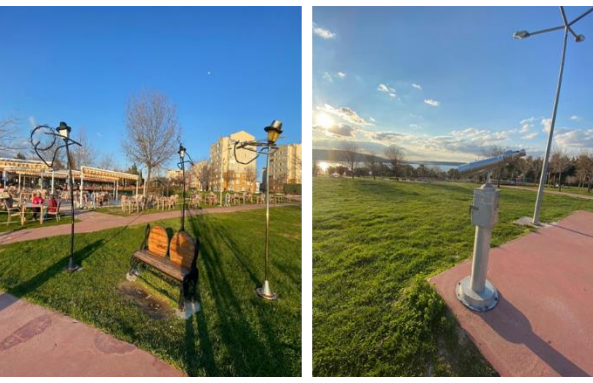
Figure 28. Design compositions (Original, 2022)

The use of different design compositions and equipment created in the area has made the area a center of attraction by attracting the attention of the users (Figure 28).