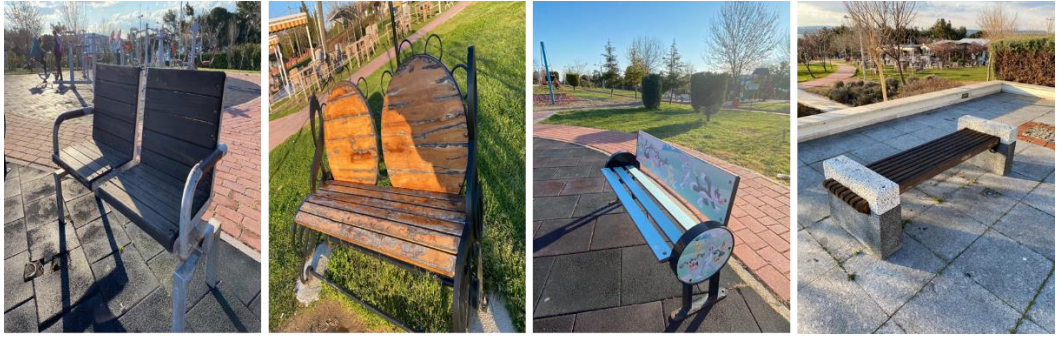
Figure 30. Seating elements (Original, 2022)

As a seating element in the area; Seating elements with wood-metal details and wood-concrete details were preferred (Figure 30).