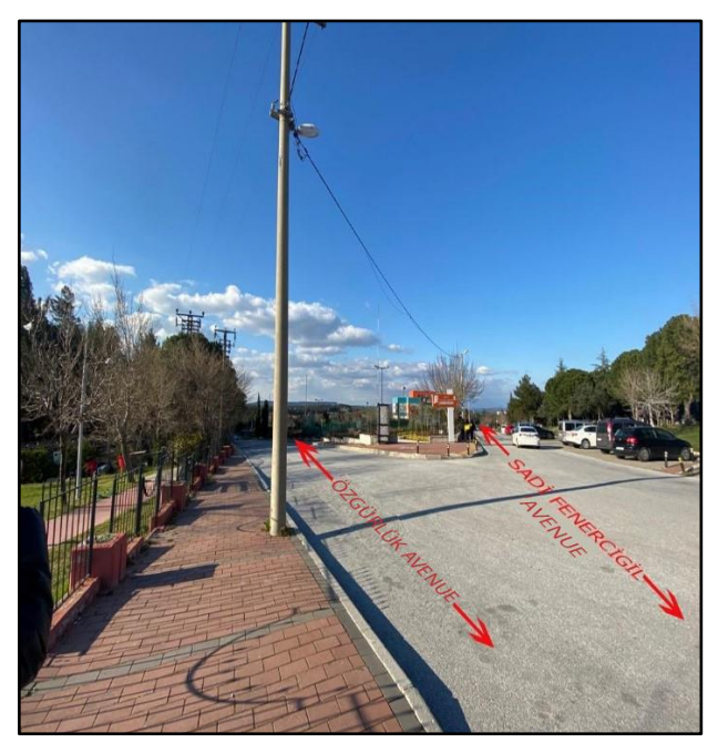
Figure 6. Study area neighborhood (Original, 2022)

fact that the area is positioned in line with the bus stops, as well as being at the intersection of Özgürlük Avenue and Sadi Fenercigil Avenue, which is one of the important transportation axes, creates a positive effect in terms of availability in the area (Figure 6).