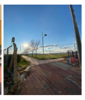
Figure 10. Park entrances (Original, 2022)

To disconnect the area from the external environment and to separate the park from the immediate surroundings, a concrete flower pot and iron fence detailed limiting element and a wire mesh limiting plant element was used (Figure 11).