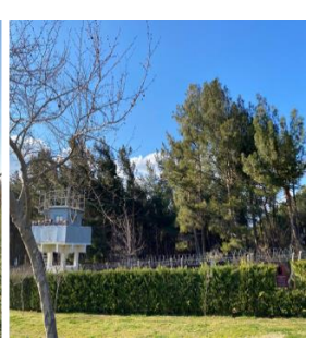
Figure 11. Limiting elements and plant elements (Original, 2022)