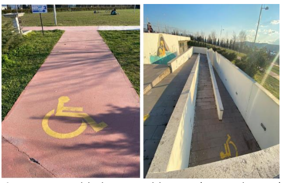
Figure 17. Disabled compatible uses (Original, 2022)

Inclusivity: The area provides opportunities for communities of all ages and walks of life to come together and carry out activities without discriminating between men, women, old and young. At the same time, the uses were designed and created by considering architectural standards such as slopes and dimensions suitable for disabled use (Figure 17).