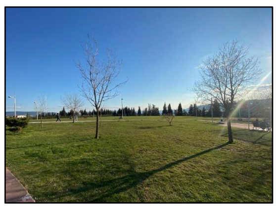
Figure 7. Green texture dominates the area (Original, 2022)

Legibility: Due to the fact that the park consists of green areas, it is separated from the surrounding spaces in terms of texture (Figure 7). The presence of green areas in the urban fabric provides many social, economic, and ecological functions to the city (Önder & Polat, 2012).