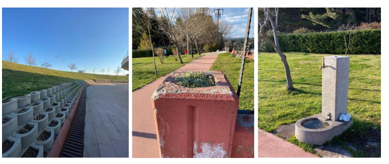
Figure 34. Concrete plant crates (Original, 2022)

Plants were used in concrete plant boxes to create aesthetic visual beauty in the area (Figure 34).