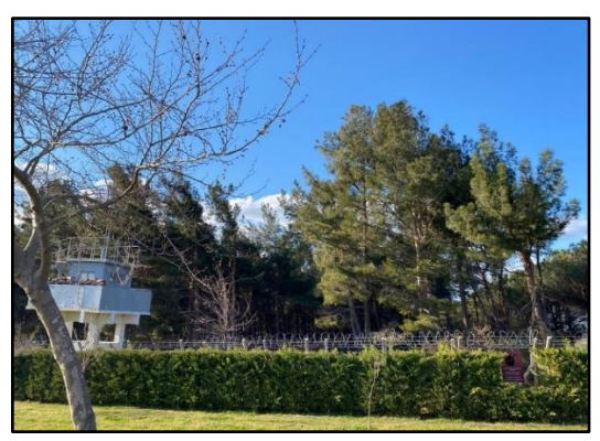
Figure 20. Military District (Original, 2022)

Safety: The security of the area is ensured by controlling it with a hidden camera. In addition, the use of another area adjacent to the area as a military zone makes the park more reliable (Figure 20).