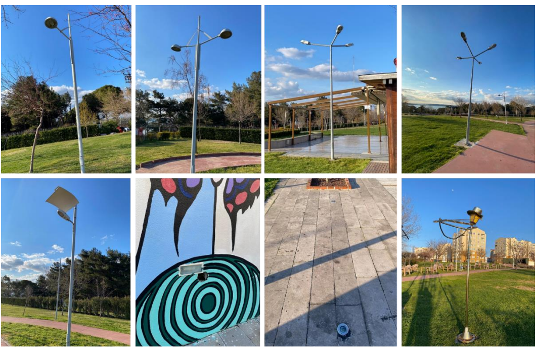
Figure 29. Lighting elements (Original, 2022)

As a seating element in the area; Seating elements with wood-metal details and wood-concrete details were preferred (Figure 30).