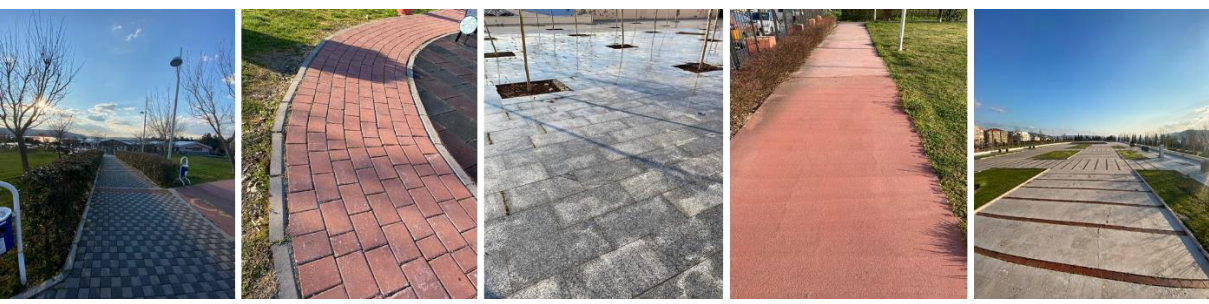
Figure 32. Flooring materials (Original, 2022)

There are not many shading elements in the area, since it is generally a light green area. PVC tarpaulin shading element, which can be opened and closed, is generally used in the seating areas (Figure 33).