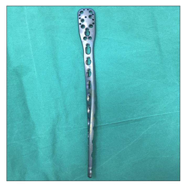
Figure 1. An image of 70-degree contoured PHILOS plate

For the 70° contoured helical PHILOS plate Group, a 5-cm skin incision was made on the anterior projection of the distal humerus. The brachial muscle was split into the medial and lateral portions, and the anterior aspect of the humerus exposed. The musculocutaneous nerve branches were not routinely identified and dissected. Distal and proximal screw fixation was made as described in Group 1. At least 3 bicortical screws were used for distal screw fixation in both groups. From the posterior tip of the acromion to the olecranon, the length/shortening of the limb was measured with a ruler and compared to the contralateral side ( Figure 2 ).