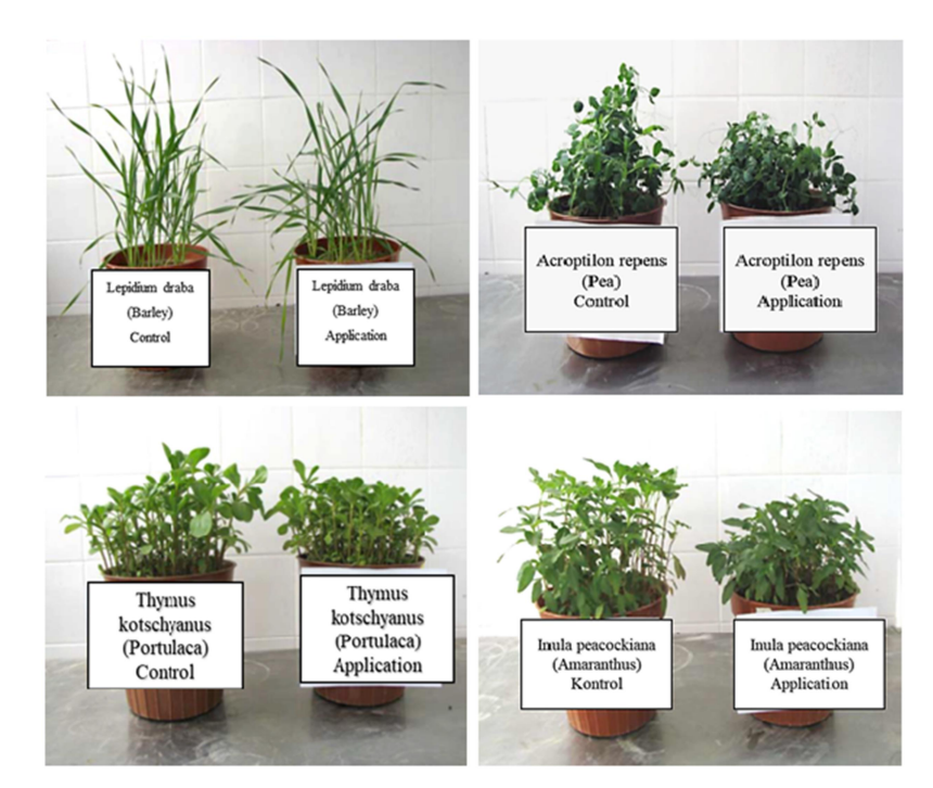
Figure 2. General morphologic effects of plants extracts on target seedling.

The effects of aqueous extracts were variable. Although aqueous extracts did not affect barley and pea growth, Inula and Thymus extracts negatively affected weed development, especially Amaranthus seedlings (Fig. 2).