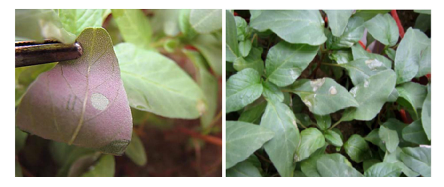
Figure 1. Lesion on pea leaf caused by Inula peacockiana plant extracts.

The effects of aqueous extracts were variable. Although aqueous extracts did not affect barley and pea growth, Inula and Thymus extracts negatively affected weed development, especially Amaranthus seedlings (Fig. 2).