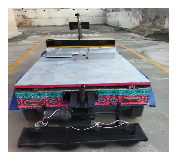
Fig. 4. The developed road cleaner