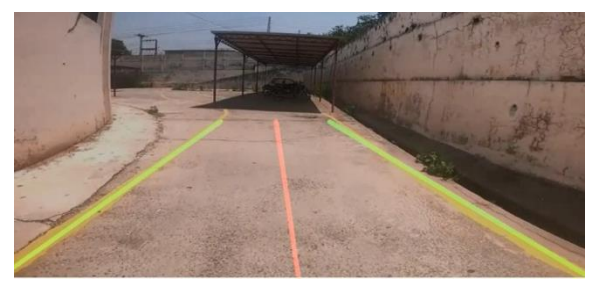
Fig. 2. Cleaner's field of view extracted lanes and heading as suggested by the algorithm

In this section, we provide detailed discussions regarding the performed experiments and their results. The camera field of view obtained by the cleaner detected left & right lanes and the suggested heading of the vehicle based on the steering angle is depicted in Figure 2.