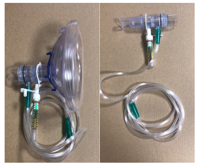
Fig. 1. EzPAP® positive airway pressure therapy system

significant regression was observed in the control chest X-ray (Fig. 2).